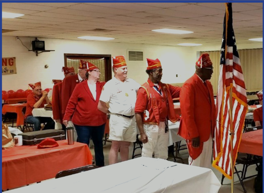
Installation of line officers