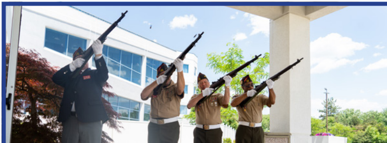
Department Honor Guard Rifle Salute