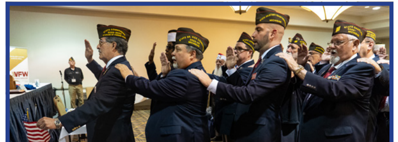
Installation of 2022-2023 Department Officers