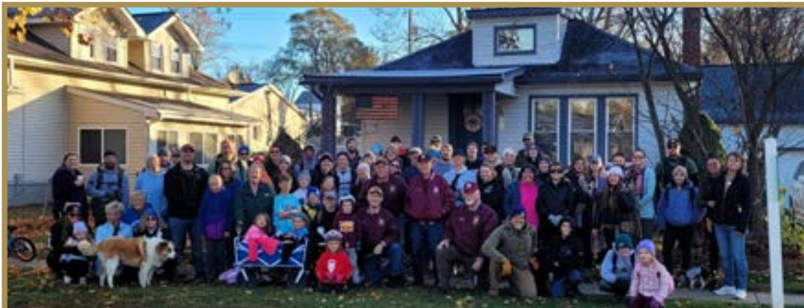
On Nov. 9th the 5th Annual Ruck Walk was held to raise money for veterans awareness and programs in the community. 6 Post members and 72 community members walked, and over $2,500.00 was raised.