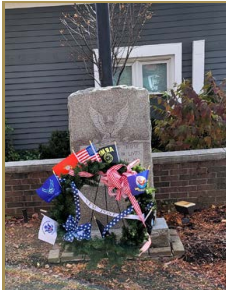
Veterans Day Post 582 placed a wreath on our WWII monument.