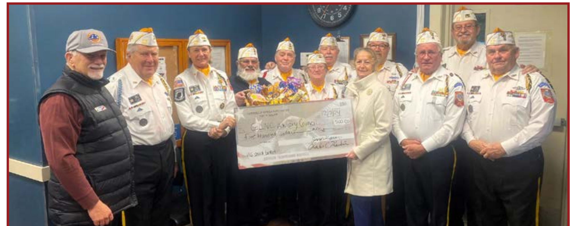
The VFW Post 334 Honor Guards presented a $500 check to the GLNC Advisory Committee for use in maintaining the food & snack basket (example held above the check) in the Honor Guard building.