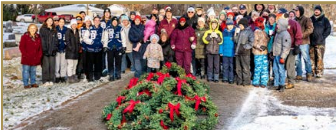
Dec. 12th Post members and community volunteers placed 641 wreaths on veterans graves at Ortonville and Seymour Lake cemetery's.