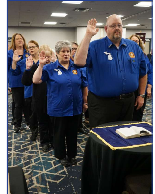
2026-2027 Auxiliary Installation