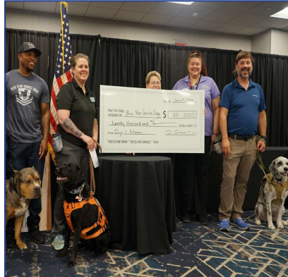
Blue Star Service Dogs donation check presentation from the VFW Auxiliary