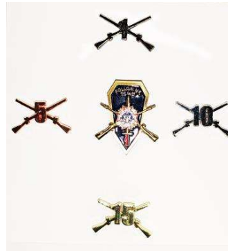
Commander-in-Chief Pin and Recruiting Pins