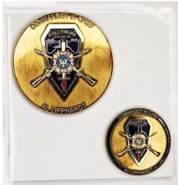
Commander-in-Chief Medallion and Coin

Below you will see examples of some of the awards and items mentioned in this program. For more information, contact the VFW Membership Department.